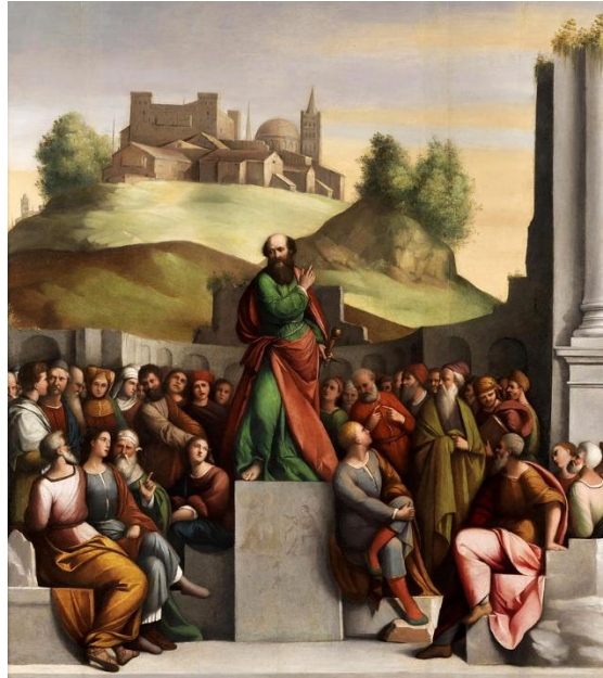
“Saint Paul delivering the Areopagus Sermon in Athens” by Benvenuto Tisi